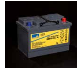
VRLA Battery Maintenance free Lead acid battery with a designed lifetime of 7 years.