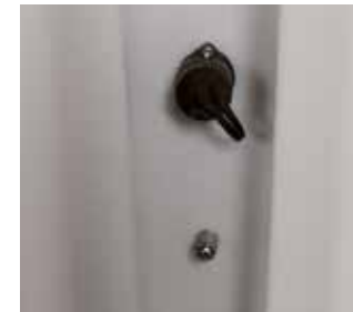
Auxiliary connector (Optionally) enables external charging or additional solar modules.