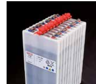
NiCd Battery High quality NiCd battery for use in low temperature areas down to -40 °C with Arctic electrolyte.