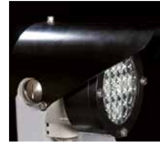
Aluminium housing Rugged housing with sunshield.