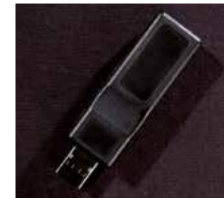
Programming with PC Using Sabik USB interface.