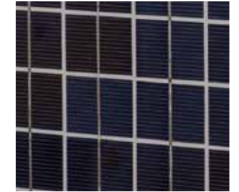
Solar Modules Solar modules with tempered glass front well integrated with the PE-housing.