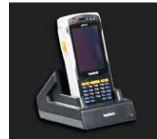
PDA Programmer Wireless two-way communication using a Windows based PDA with infra red port. Flash code, range and photocell switch level etc. can be set. The Programmer can also retrieve the event log.