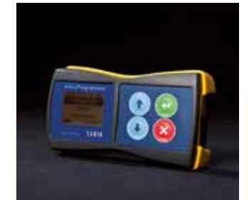
Sabik Easy Programmer User friendly and compact wireless two way programmer.