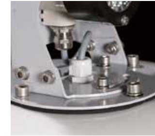
Adjustable Field adjustable in both horizontal and vertical direction.